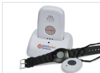
Medical Alert wristband and pendant