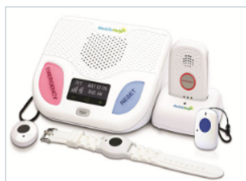
MobileHelp medical alert system